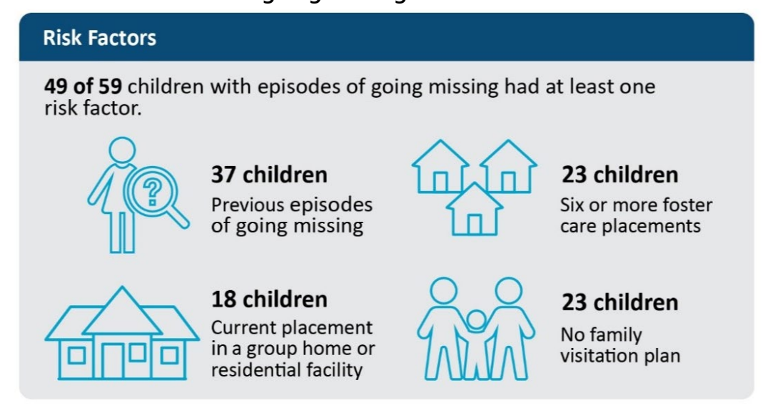
Exhibit 2: Most of the children had at least one risk factor associated with increased likelihood of going missing from care.