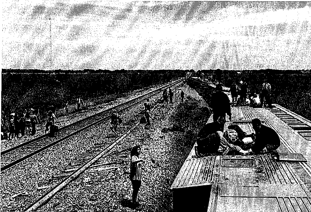
Figure 2: Passengers climb from the derailed Amtrak train on June 27, 2022.

18. As a result of the collision, the Plaintiffs were violently thrown within the derailed Amtrak train and sustained serious injuries.